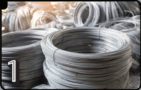
1 Wire Rod Sourcing