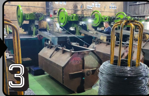
3 Nail Forming & Threading