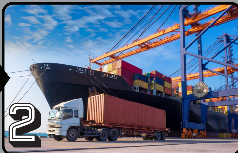
2 Drayage Transporting