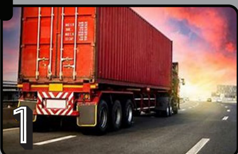
1 Domestic Receiving