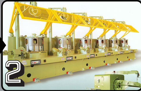
2 Wire Drawing