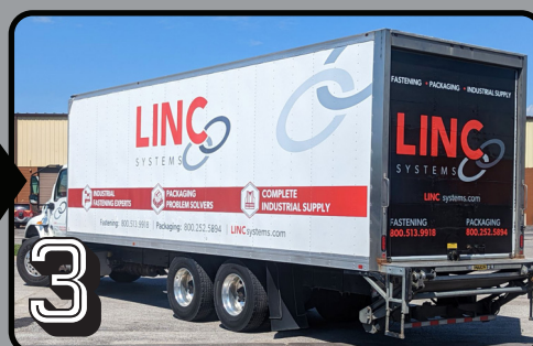
3 Shipping & Delivery