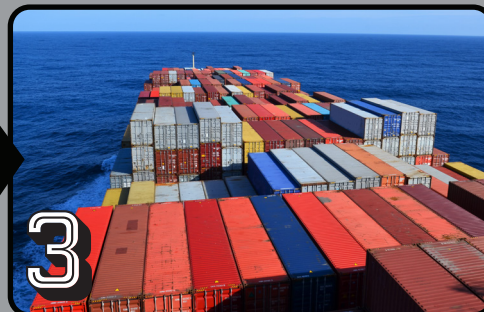
3 Ocean Freighting