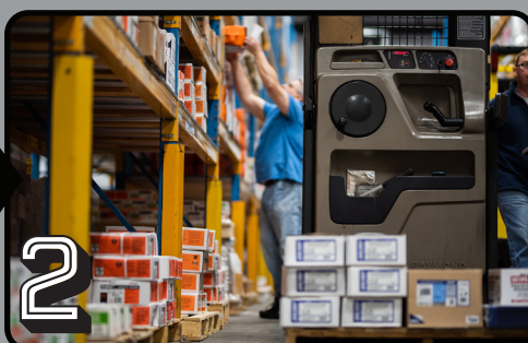
2 Order Processing