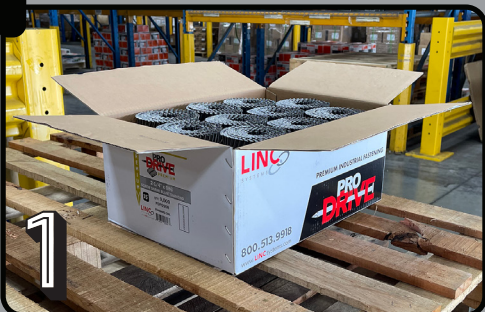
1 Boxing & Packing